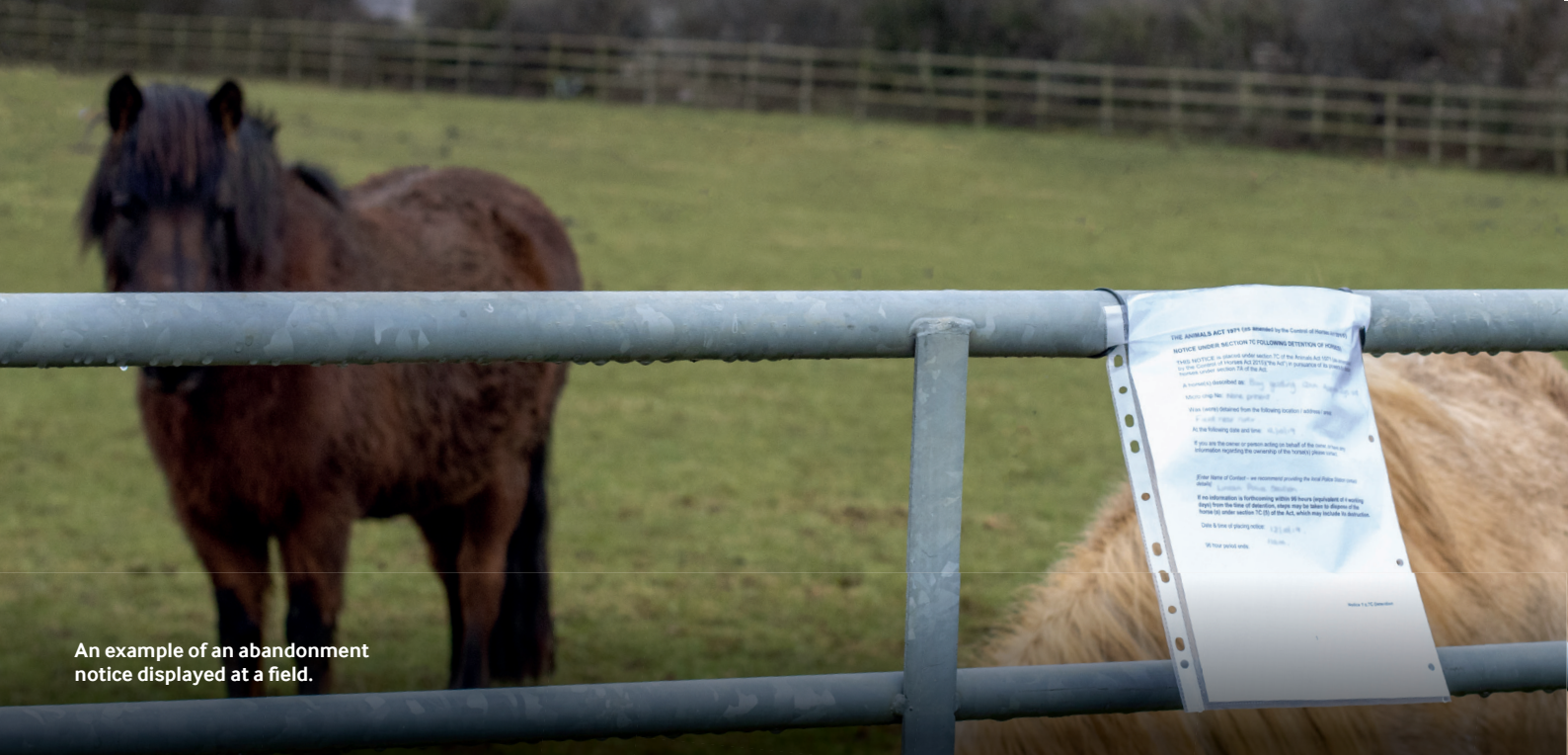
An example of an abandonment notice displayed at a field.