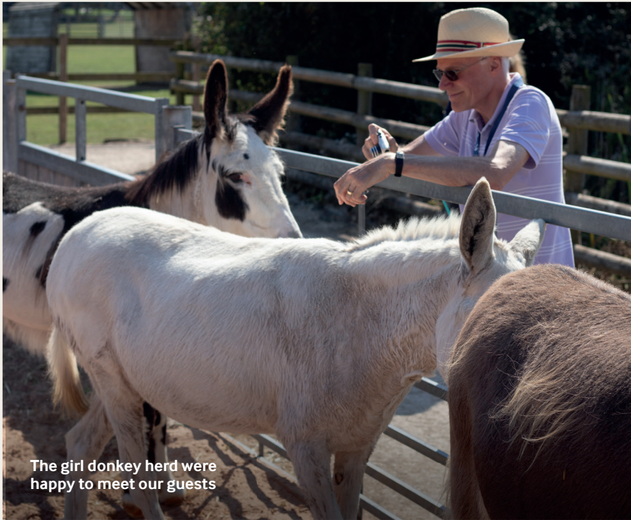
The girl donkey herd were happy to meet our guests

Once horses were secure, the team opened the round pen up to the sides of the trailer ramp with the same herding method used to gently usher the equines into the trailer.