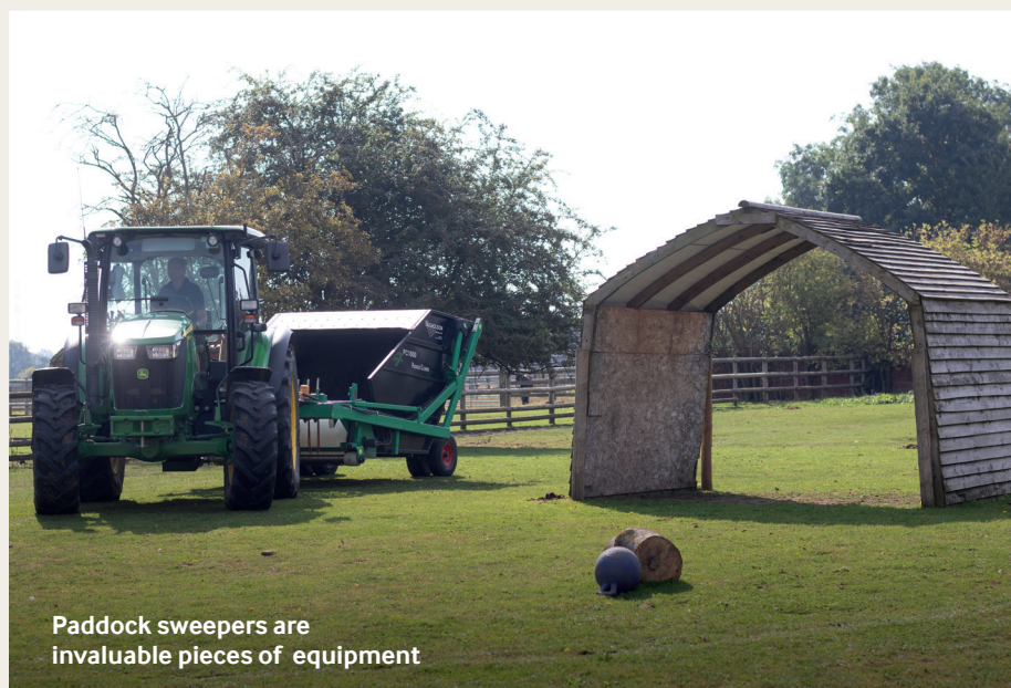
Paddock sweepers are invaluable pieces of equipment