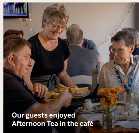
Our guests enjoyed Afternoon Tea in the café