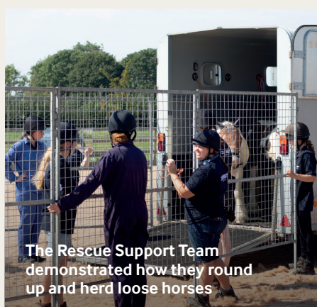
The Rescue Support Team demonstrated how they round up and herd loose horses