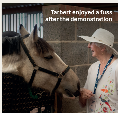
Tarbert enjoyed a fuss after the demonstration