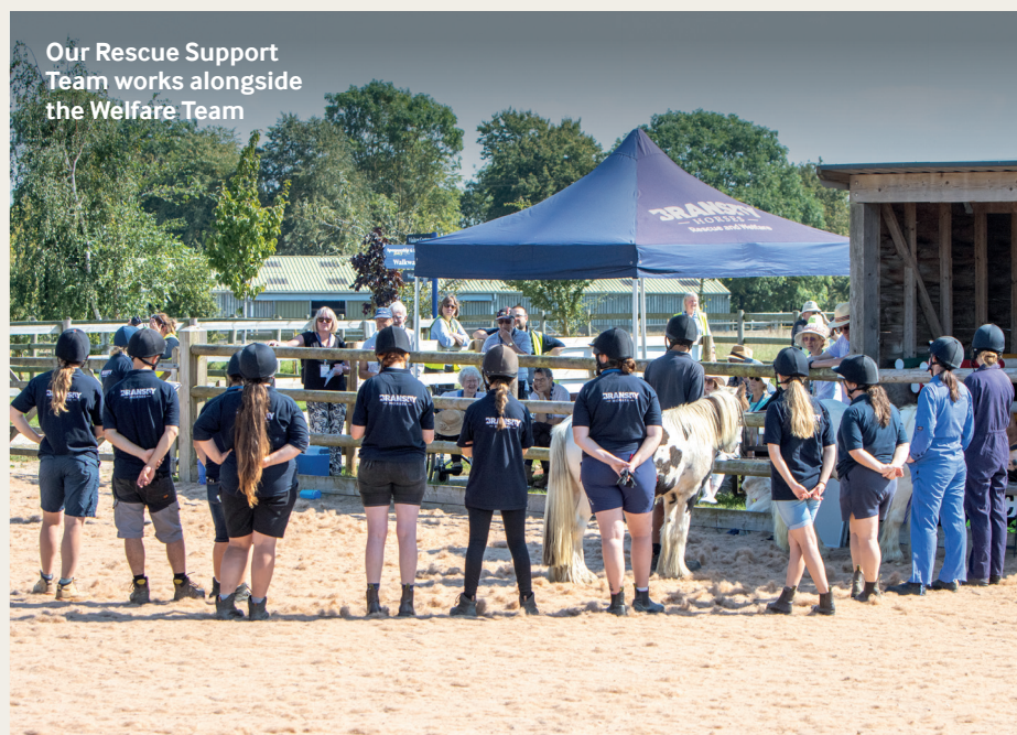
Our Rescue Support Team works alongside the Welfare Team