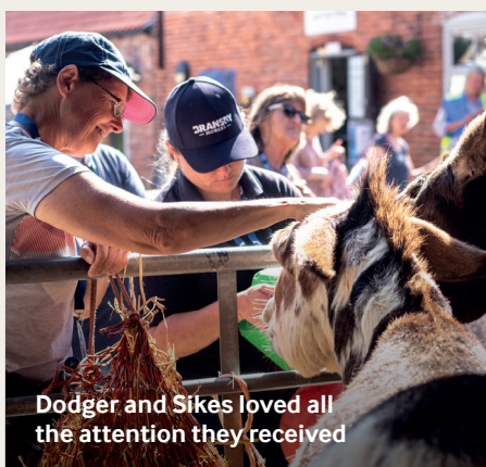
Dodger and Sikes loved all the attention they received