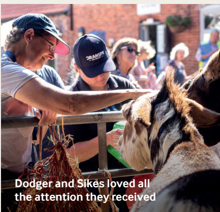
Dodger and Sikes loved all the attention they received