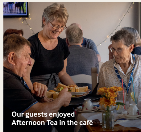
Our guests enjoyed Afternoon Tea in the café