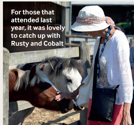
For those that attended last year, it was lovely to catch up with Rusty and Cobalt