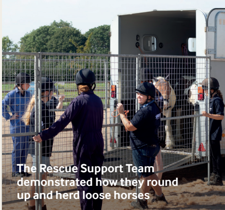
The Rescue Support Team demonstrated how they round up and herd loose horses