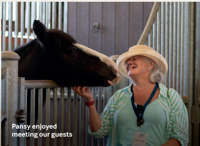
Pansy enjoyed meeting our guests

using our field sweepers; machinery that allows us to clear our larger-sized paddocks efficiently. Guests got to see first-hand a comparison of how long it takes for two members of staff to 'poo pick' one area of a field, compared to the time it takes for a paddock sweeper to cover that same field.