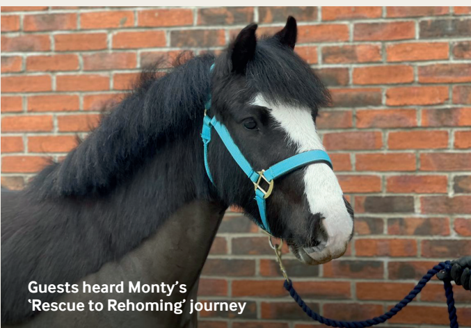
Guests heard Monty's 'Rescue to Rehoming' journey