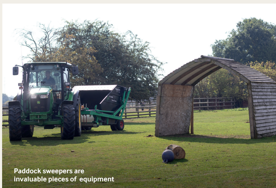
Paddock sweepers are invaluable pieces of equipment