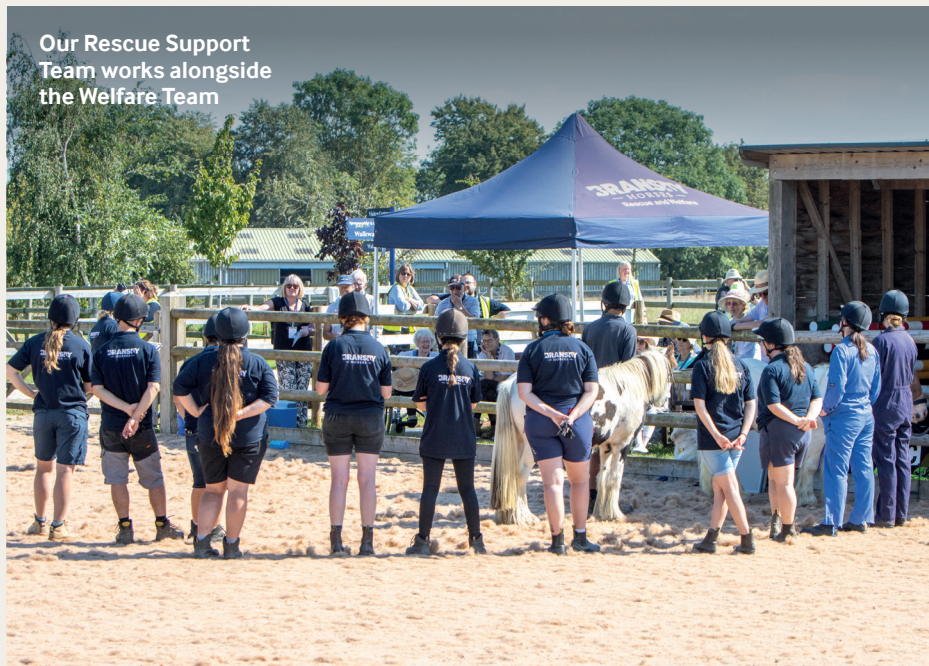
Our Rescue Support Team works alongside the Welfare Team

Set up in the arena was a round pen used by our teams to help contain horses, and one of our trailers. We were then joined by the two main stars of the show, Milo and Gerald, who were let loose into the arena. The Rescue Support Team demonstrated how they round up and herd loose horses into the round pen, forming a line to create a human barrier and herding the equines into the safety of the round pen.