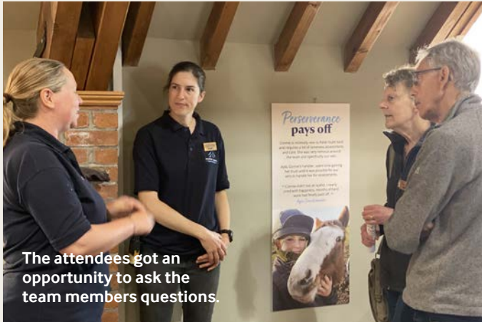
The attendees got an opportunity to ask the team members questions.