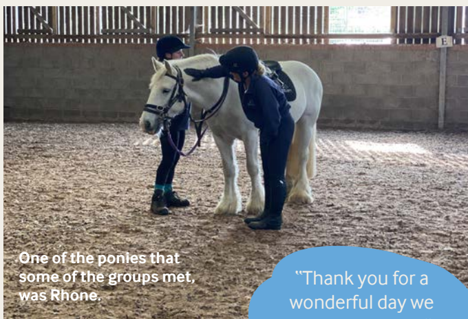
One of the ponies that some of the groups met, was Rhone.