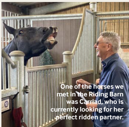
One of the horses we met in the Riding Barn was Carriad, who is currently looking for her perfect ridden partner.