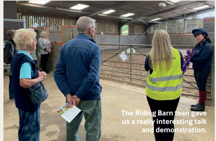
The Riding Barn team gave us a really interesting talk and demonstration.