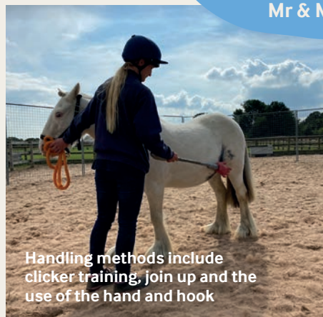
Handling methods include clicker training, join up and the use of the hand and hook